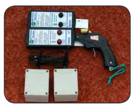
wireless start devices and wireless dongle