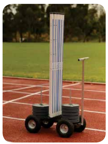
Timing Gates, bases and carrier